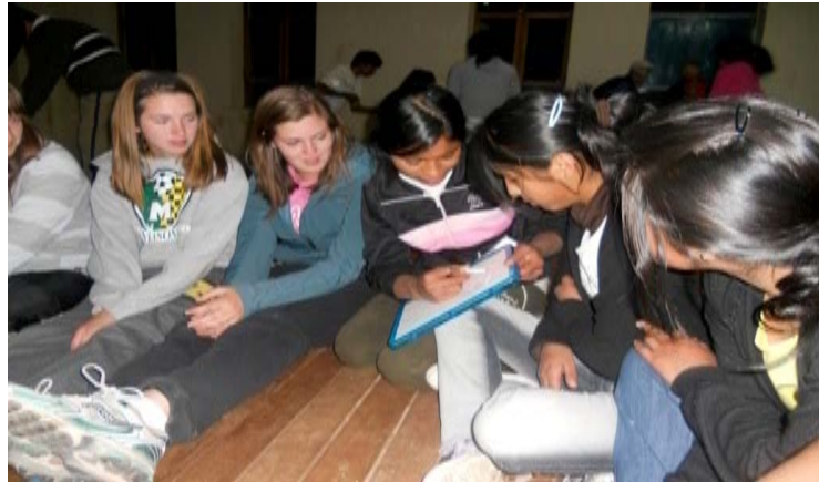
A game of bi-lingual Pictionary

In the end, there was a clear sense that the week had been a success. Not only had walls been painted and bunk beds installed, but relationships were forged and we all learned more about what it means to be the diverse body of Christ. The closing worship service was a time for exchanges of gifts, tears, and hugs, saying goodbye with promises to keep in touch and to pray for one another. This was a first step toward one another, into that in-between space where God's presence is felt in a special way. What a privilege to be called to share in such holy places of encounter!