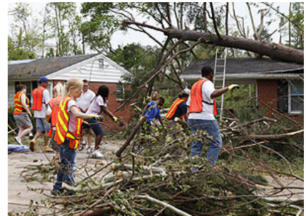
Volunteers dealing with damage in South.

An unprecedented number of severe storms, including tornadoes and high winds, have battered parts of the United States, causing widespread damage. Especially hard hit were states in the South. Tornadoes in Alabama on April 27 caused more than 200 deaths in that state alone. Up to a million people were left without power and local officials said it could take days to restore electricity. Lives were also lost in Mississippi, Tennessee, Georgia and Virginia, bringing the preliminary total to more than 300.