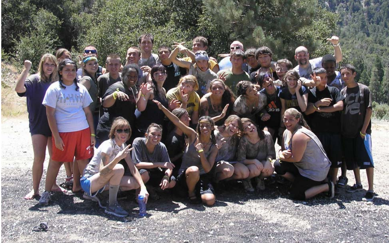
A group of teenagers from First, Burbank's student ministry program.