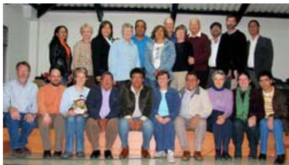
U.S. and Colombian delegates to the Colombia Mission Network meeting in Bogotá, February 2011

Even in this Good Friday world, the IPC and its members choose to proclaim the Resurrection. Living with hope and joy, promoting peaceful alternatives for their communities and nation, they insist on the promise and possibility of a different way, founded on their faith in Jesus, who came so that we might have life. How can we, from the United States, do likewise? I don't have an easy or complete answer, but there are steps we are taking to live in hope and solidarity with our brothers and sisters in Colombia.