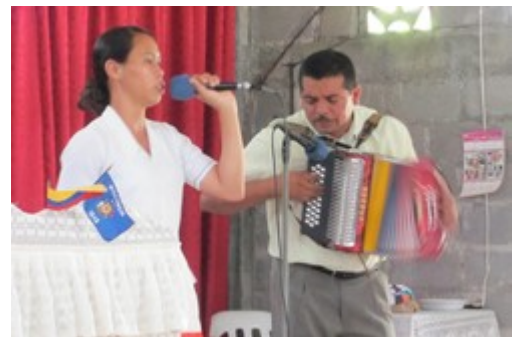
Church musicians praise God through song in Urabá, Colombia

As I sit to write, my thoughts keep going back to the church band. The singer expressed the effect God's love has had in her life — how even in the midst of a sinful, indifferent world she recognizes the need for change and to share that love with those who so desperately need it. And something within me says, Amen. So, what does it mean to look for Jesus the Savior in this world of pain, violence and injustice? And, when we are able to see Jesus in the midst of it all, what is he saying? What is he doing? Who is he with? How can we live today as faithful disciples of the one who said, "Follow me"?