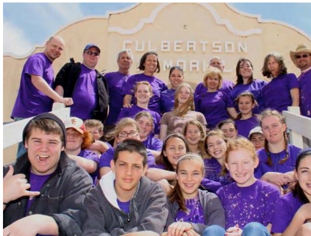
LCPC's Arizona Mission Team