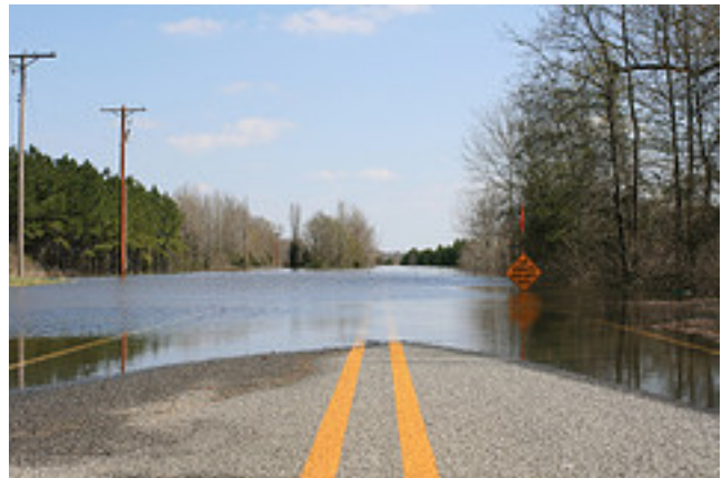
A flooded highway in Arkansas cuts off access to Georgetown

The following comment was offered by a Presbyterian minister in Arkansas who has been helping to provide hot meals to storm victims in his home state: "This was the gospel, I thought to myself, sharing our love, demonstrating God's presence through grace, asking nothing in return, leaving the glory to God and especially being warmed by the joy of the experience for the rest of our lives."