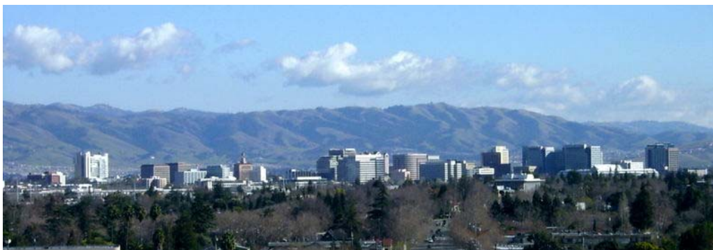
San Jose, California, location of the 218th General Assembly

One of the major tasks facing the commissioners will be studying the recommendations of the Form of Government Task Force. The members of the task force have proposed changes to the constitution that they feel could provide a more flexible, foundational polity that would be appropriate for a missional reformed church in the 21 st century. They will present their proposals for adoption by the Assembly and rec-