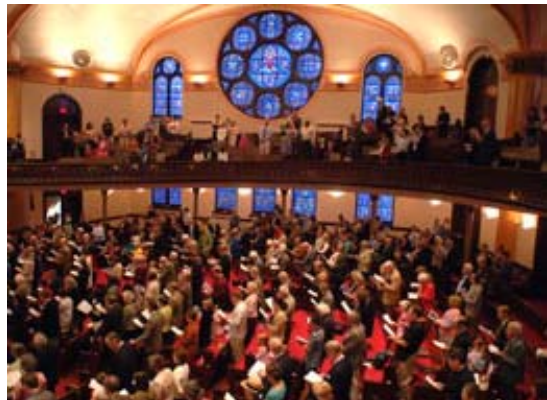
Westminster Presbyterian Church in Minneapolis