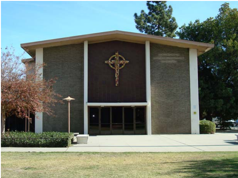
Panorama Presbyterian Church